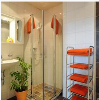
2-4 Personen · 1 Bedrooms