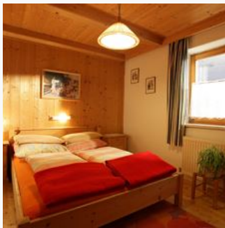
1-4 Personen · 1 Bedrooms

50m 2 , SAT-TV, cot, highchair, garden, 1 longe with doublebed, 1 double bedroom, kitchen, shower/toilet