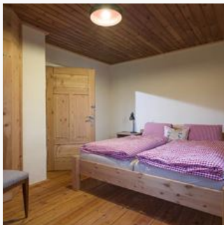
2-4 Personen · 2 Bedrooms · 50 m 2