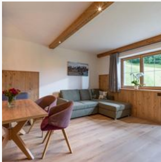
1-4 Personen · 2 Bedrooms · 65 m 2