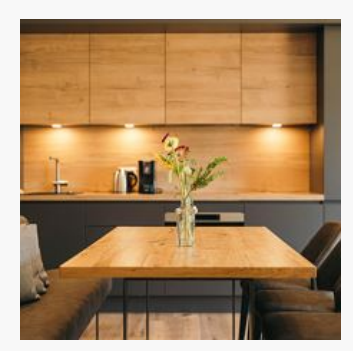
1-4 Personen · 2 Bedrooms · 57 m<sup>2</sup>